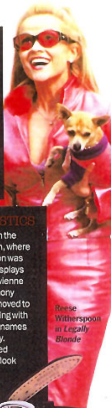
Reese Witherspoon in Legally Blonde

Alanis Morissette (video for "You Live"); Wyclef Jean (video for "How Come"); Enrique Iglesias (video for "Rhythm Divine"); REM (video for "The Great Beyond"); The Wallflowers (video for "Letters from the Wasteland"); Reese Witherspoon, right ( Legally Blonde and Sweet Home Alabama )